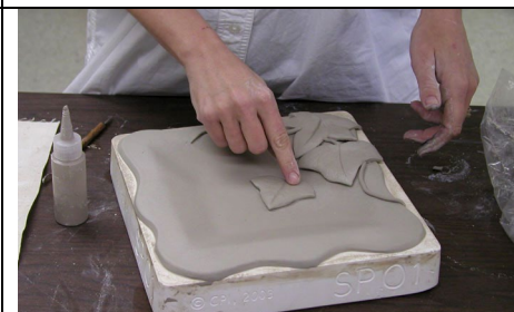
STEP 20: Depress the ivy onto the scored area on the plate.