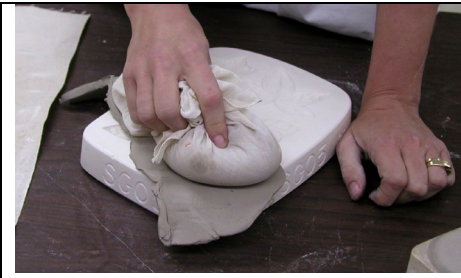
STEP 13: Using the bag of sand, pounce the clay into the form.