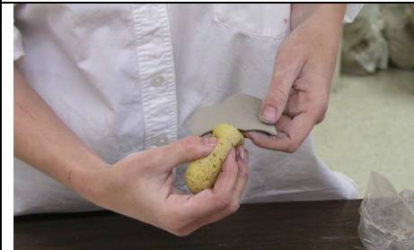
STEP 16: Use a moistened sponge to lightly clean edges of the ivy.