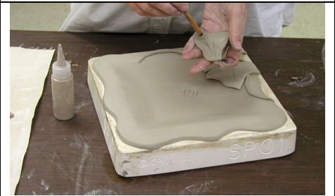
STEP 18: Use a cleaning tool to lightly score the back of the ivy.