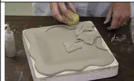
STEP 23: Gently clean the leaves, plate, and vines.