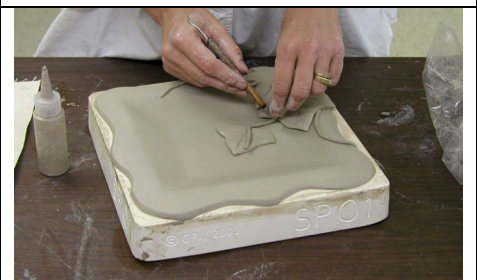
STEP 21: Roll thin ropes of clay and slip and depress the ropes onto the plate as ivy vines.