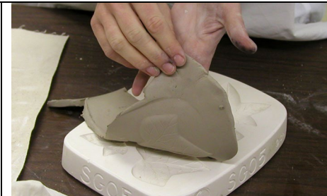
STEP 14: Lift the clay from the form.