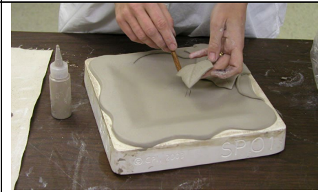
STEP 17: After arranging the ivy on the plate, lightly score the area below the ivy on the plate.