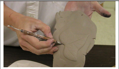
STEP 15: Using a cleaning tool, cut the ivy shape from the clay. Repeat 12-15 until you have gathered the desired number of clay ivy leaves.