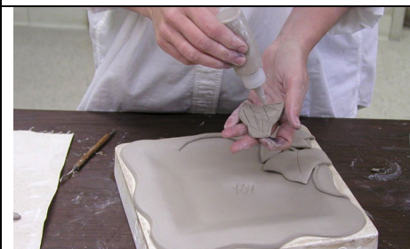
STEP 19: Apply a small amount of low fire white slip to the back of the ivy.