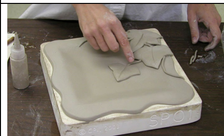
STEP 22: Run the vines onto the appropriate area of each leaf.