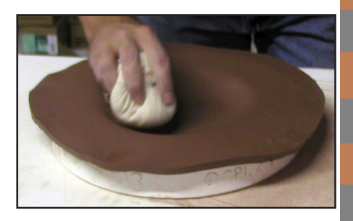
Pounce into slump using the sandbaa.