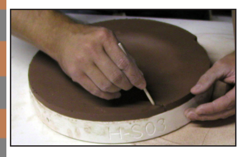
Trim the clay to fit the slump. You can make the edge round or notched, as it is here.