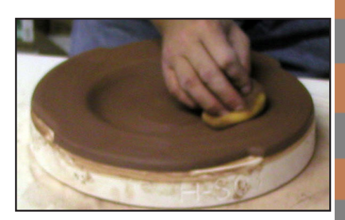
Smooth the inside rim with the sponge as well.