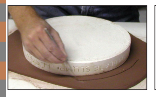
Roll out a slab of clay large enough to fit the HS03 Slump. Mark and trim around the slump.