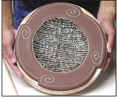
Dry thoroughly and fire to a witness cone 04. Glaze with clear glaze and fire as instructed.